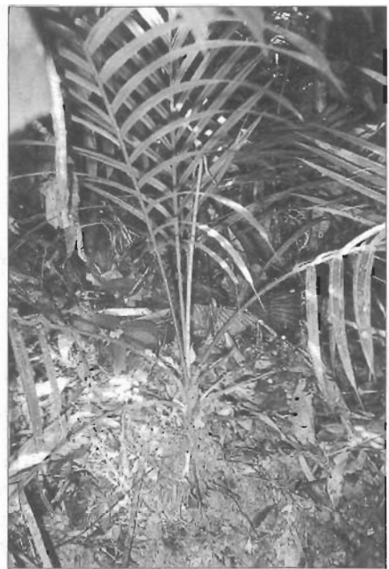
Plate 13 I. kelantanensis : Stemless and solitary, with interfoliar inflorescence.