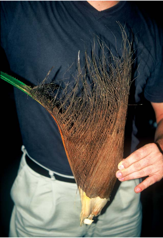
2. Trachycarpus geminisectus , leaf sheath.

collected in the Village below, and a few more alongside the road to Bat Dai Son. Of course we could not wait to have a closer look at the specimens and immediately spread everything out on the pavement right in front of the hotel entrance. As I was taking a closer look at the material, my heart sank. These plant parts looked identical to those of our well-known friend Trachycarpus fortunei , just as popular here in Vietnam as it is in China for the durable fibers that clothe the trunk. One large leaf and a small plant, however, looked different. Du and Anh pointed out that these were the specimens collected on Chong To Tien. The big leaf appeared very leathery and durable as well as unusually large compared to that of T. fortunei . The lower surface was covered with a thick, whitish waxy layer. After looking at the leaf for a while, I realized that all of the 40 segments were joined in pairs for their entire length, appearing as if there were only 20, which gave the leaf a very bold and bulky appearance. The leaves on the small plant, a juvenile of perhaps 1 m (3 ft.) tall overall, showed the same characteristics. Of particular interest to us were also the fibers of the leaf bases as they differ quite dramatically within the genus and provide easy clues for the identification of various species. Martin noted that this Trachycarpus had the