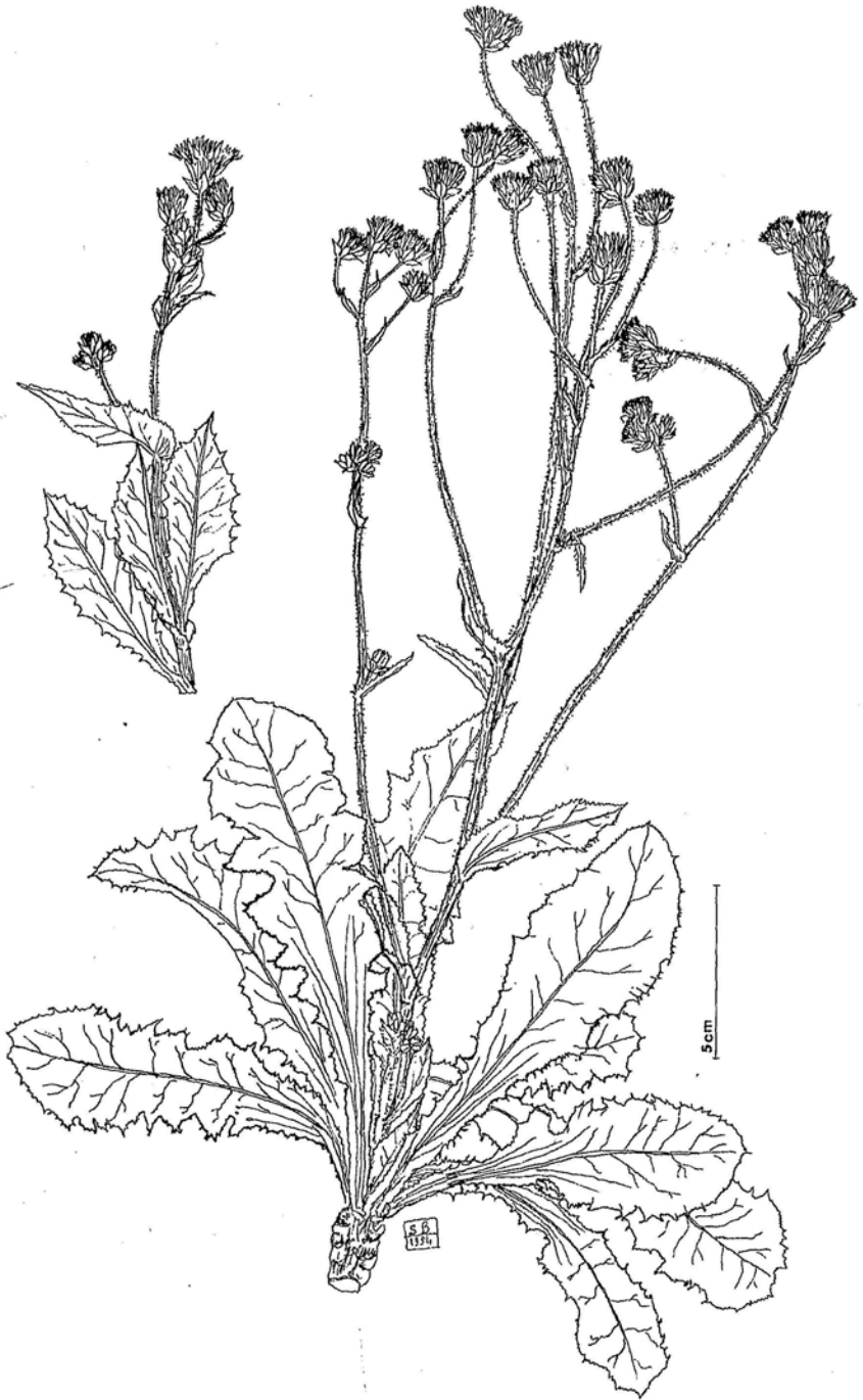
Fig. 1. Habit of Crepis aspromontana Brullo, Scelsi & Spampinato.