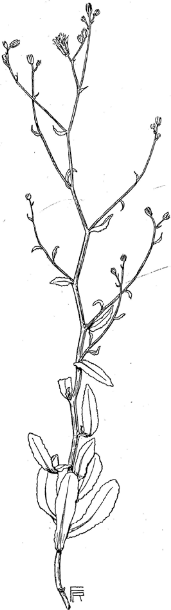
Fig. 144. Lactuca Koelzii (Kz. 12616). \frac{1}{2} .

divaricate intricate ramosissimus, pallide viridis teres glaber tenuiter striatus, omnino aphyllus, ad basin ramorum tantum squamis minutissimis triangulari-lanceolatis acuminatis herbaceis indistincte membranaceo-marginatis indivisis. Capitula in pedunculis 1—4 cm longis non incrassatis terminalia. Involucrum 7—8 mm longum, oligophyllum basi attenuatum superne \pm patulum; phylla exteriora valde abbreviata, triangulari-lanceolata, intima uniseriata aequalia 7—8 mm longa anguste lanceolata a basi apicem versus sensim angustata, tenuiter herbaceo-membranacea tenuissime longitudinaliter striata, glabra laevia, anguste hyaline marginata, apice subito paulum membranaceo-dilatata vel subcorniculata saepe purpurascentia. Ligulae roseae vel lavandulaceae (e collectore) involucro subduplo longiores. Achaenia submatura 3—4 mm longa, leviter curvata, paulum compressa, basi attenuata apice breviter crasse rostrata, pallide brunea, tenuiter longitudinaliter striata. Pappus 4 mm longus, albus multiradiatus scabridulus. — Species aphylla habitu intricato-ramosissimo Launae acanthodi (Boiss.) O. Ktze vel Scorzoneræ tortuosissimæ Boiss. simillima, Chondrillæ piestocarpæ Boiss. (mihi e descr. tantum notae) quoque similis videtur sed characteribus involucri et achaeniorum potius Lactucæ sect. Scariolæ adnumeranda.