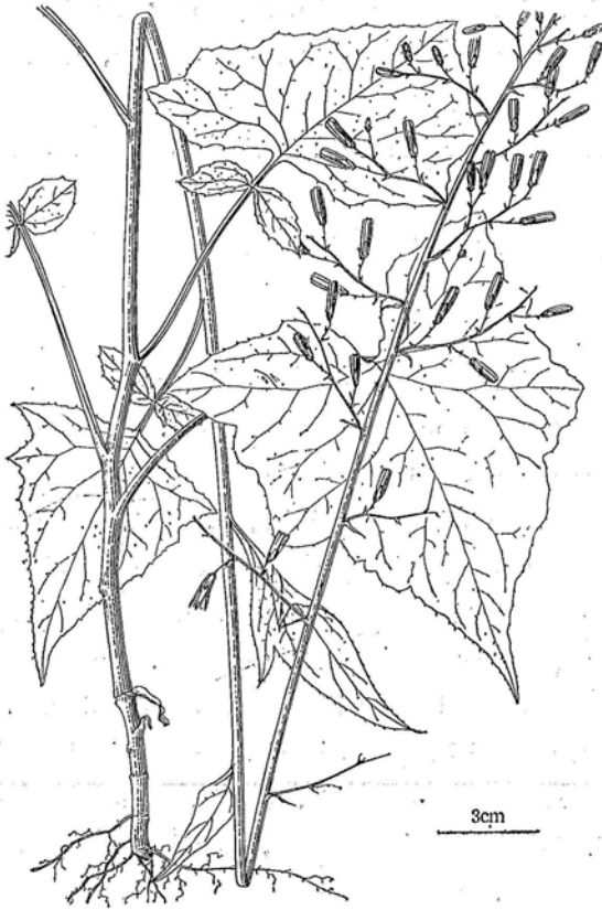
图1 细梗紫菊 Notoseris gracilipes Shih (冀朝祯绘)