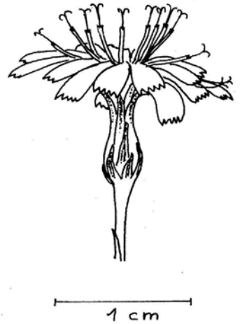
Fig.3: Wildpretia beltraniae U. et A. Reifenberger spec. nov., capitulum in anthesi