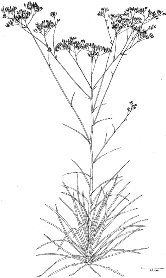
Fig.2: Wildpretia beltraniae U. et A. Reifenberger spec. nov., planta caule annuo unico