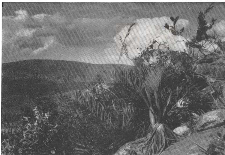
FIG. 6. S. duartei . Serra do Cipó. Acaulescent plants growing in rocky outcrops.