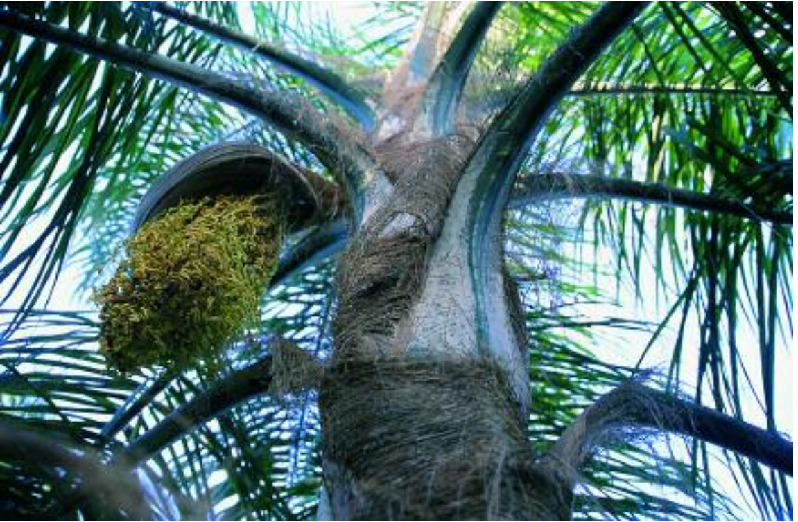
3. Syagrus vermicularis . View looking up into the canopy showing the fine sheath fibers and inflorescence.

worms and thus the epithet, vermicularis , meaning worm-shaped, referring to the shape of the primary branch tips.