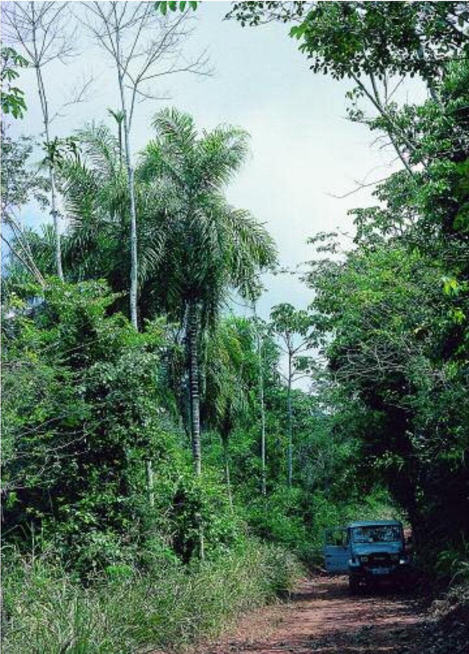
7. Syagrus vermicularis in its native habitat near Açailândia, Maranhão, Brazil.

part) near Serra Carajás and the Rio Paraupebas and probably the northern part of the state of Tocantins (Figs. 2, 6 & 7).