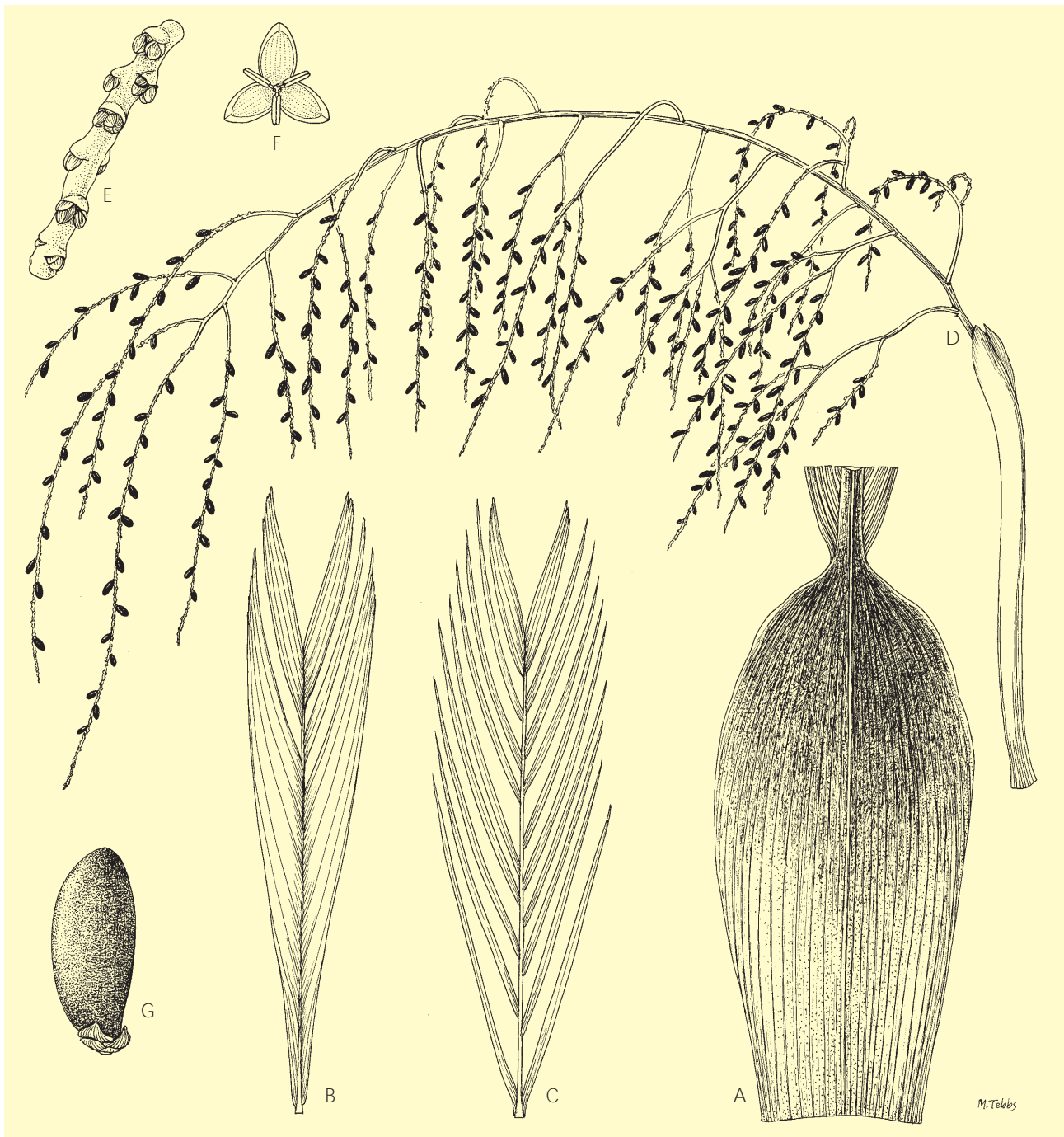
Dypsis paludosa. A leaf sheath \times 2/5 ; B, C two leaves to show variation \times 1/8 ; D inflorescence \times 1/5 ; E detail of rachilla \times 1.5 ; F staminate flower \times 10 ; G fruit \times 2 . A, C, G from Dransfield et al. JD6494, B, D, F from Dransfield et al. JD6439, E from Dransfield et al. JD6438. Drawn by Margaret Tebbs.

plant, and has hairy rachillae. In leaf it is indistinguishable from the Ambila-lemaitso taxon and also from a sterile collection in P made by Boivin (No 1706 from Tafondrou, Île Sainte Marie). This Boivin collection almost certainly represents the leaves of the specimen with the second order hairy rachillae, that Beccari interpreted as being the type of D. boiviniana ; the labels on the sheets and state "Forêt de Tafondrou, 1849, Sainte Marie de Madagascar" and are undoubtedly original, rather than new labels written by Beccari. Furthermore, this taxon survives to this day on Île Sainte Marie. The great similarity in