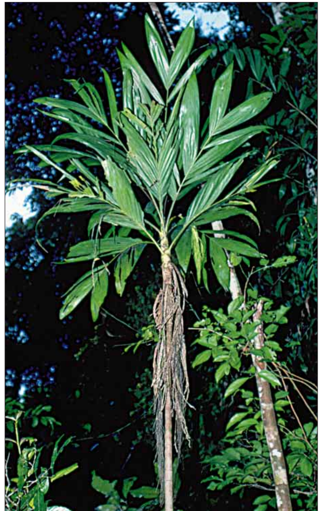
Dypsis mirabilis. View of crown ( Beentje & Andriampaniry 4687).