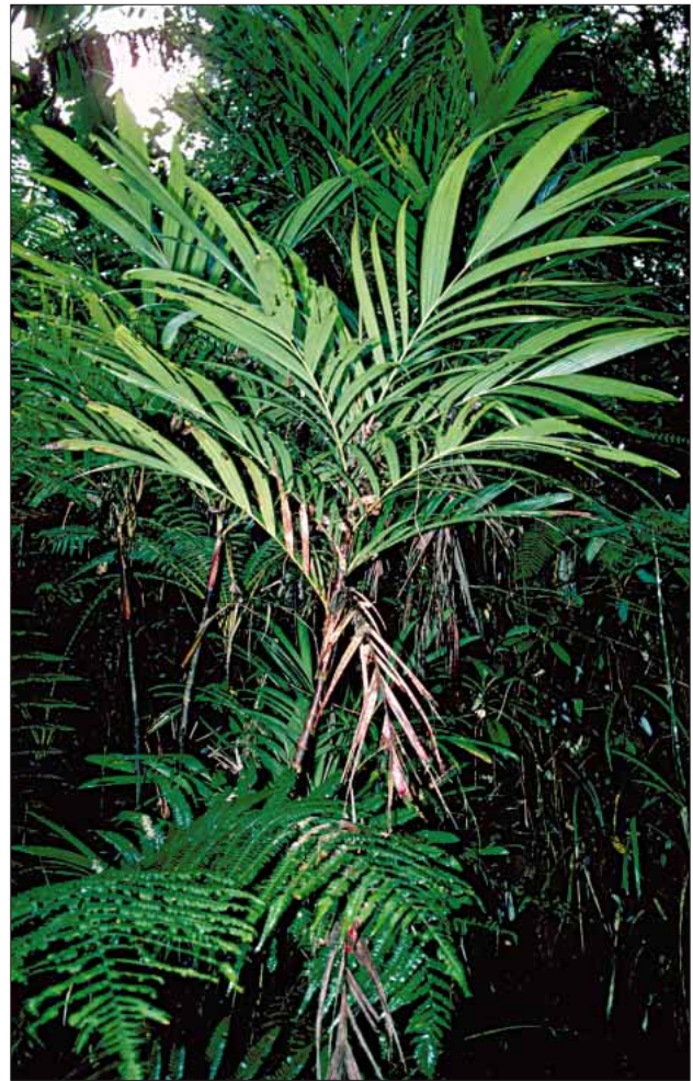
Dypsis paludosa , in the Mananara Avaratra Biosphere Reserve.