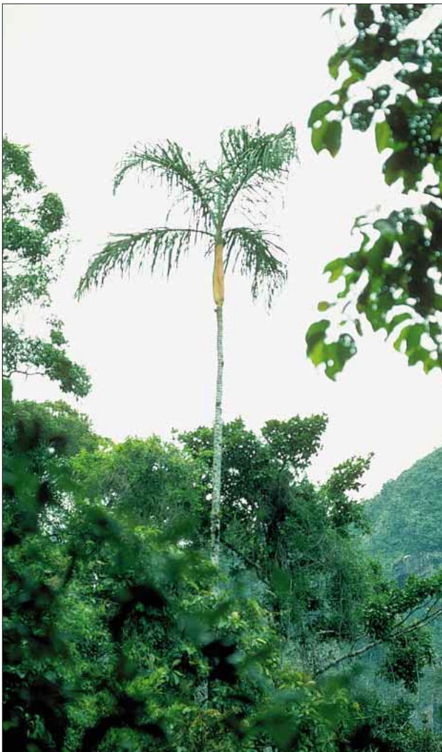
Dypsis pilulifera on the slopes of Marojejy.

Solitary palm. TRUNK 8–30 m, 10–40 cm diam., 10–12 cm diam. near crownshaft, internodes 20–60 cm proximally, 2–3 cm near the crownshaft, green becoming greyish or dark brown, conspicuously ringed, nodal scars c. 1.5 cm; wood medium hard. LEAVES 4–9, tristichous, slightly arching; sheath 1.1–1.7 m long, 3 mm thick, abaxially green, pale brown to peach-coloured with some wax and with slightly sunken large (3–8 × 1–2 mm) reddish-tomentose scales,